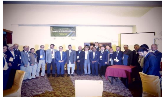
Participants during a national consultation workshop on agroforestry policy with Honorable Minister of Forest and Soil Conservation Mr. Mahesh Acharya (Centre in traditional dress) (2015)