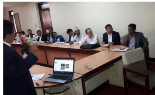
Minister of Forest and Environment (MoFE), Shakti B. Basnet reviewing the final draft of policy (2019)